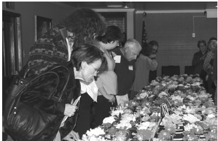
Community members enjoying Camellia blooms at the Camellia Show.