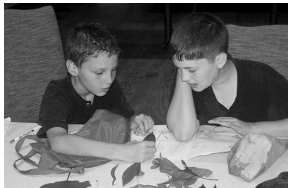
Learning at Trees and Trails

many of the project partners to develop learning opportunities along the trails that will use award-winning Project Learning Tree activities (correlated to state benchmarks). If you are interested in joining us and becoming involved in any of the numerous Trees and Trails activities, please contact Penny Miller at psm0203@bellsouth.net .