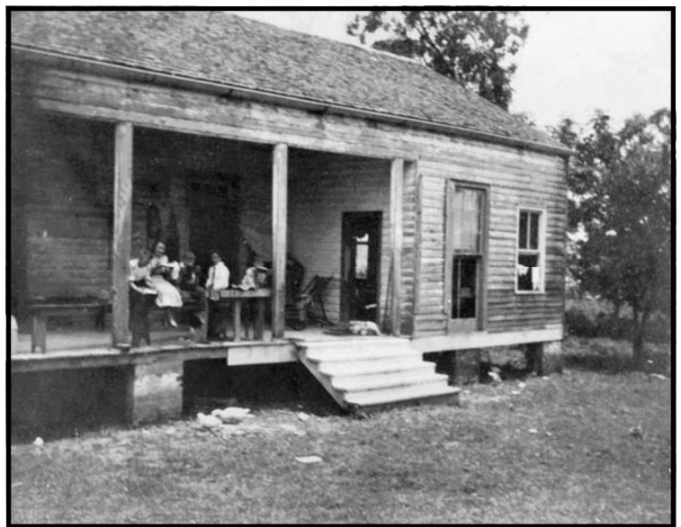
The Burden's Home