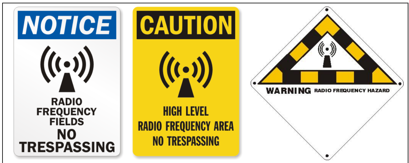
Figure 2. Typical Warning Signs for Radiofrequency Radiation