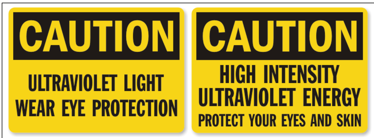
Figure 4. Typical Warning Signs for Ultraviolet Radiation