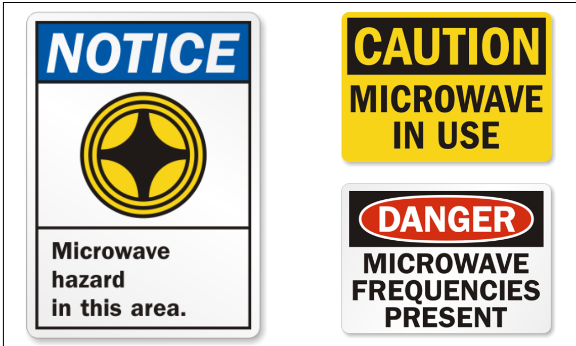
Figure 1. Typical Warning Signs for Microwave Radiation